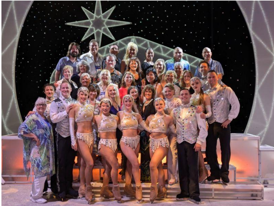
Group with the cast of Encore