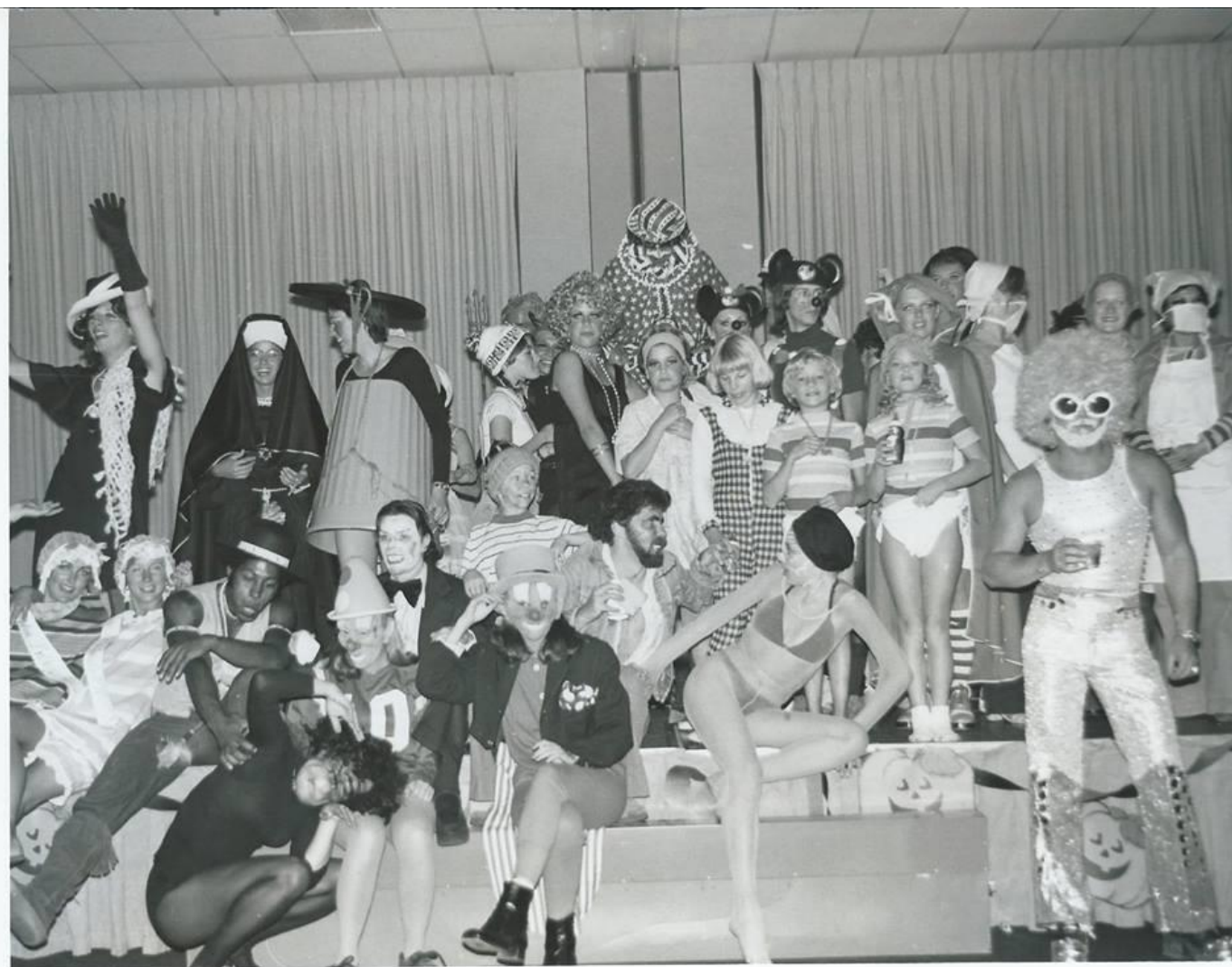
1975 West Company